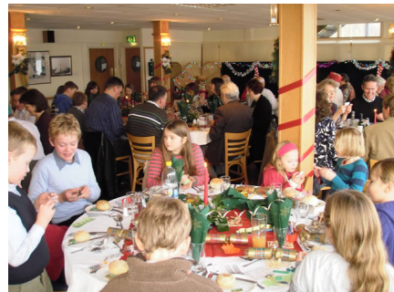
Ready for the Christmas dinner and young people at Christmas lunch