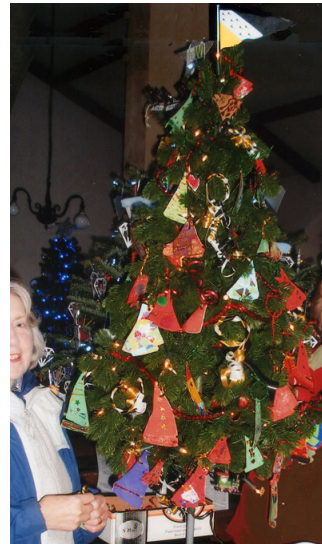
Finishing touches being applied to our tree at the Christmas Tree Festival

We shall look forward to seeing you at the Club this season – let's hope the weather is kind to us all, no matter what you choose to do.