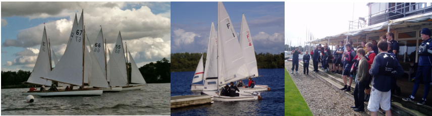
A close start in the OCSS match

Thanks again to those who lent boats, took part as competitors or helped with race management.