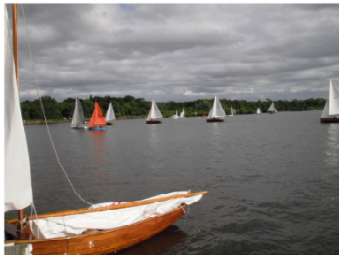
Wroxham week 2011